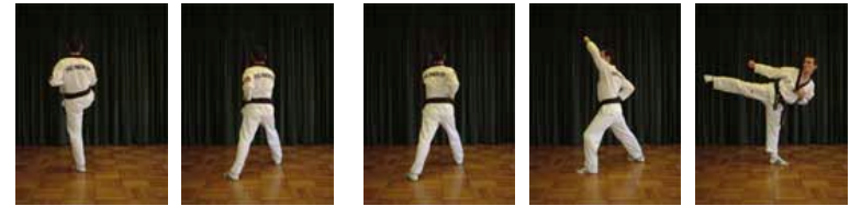
Front Kick Backfist Strike Front Stance Middle Block Front Stance High Block Front Stance Side Kick Back Fist