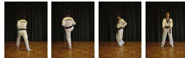
Middle Block Front Stance Front Kick Back Fist X Stance Finish Junbi Stance