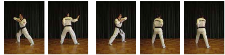
Elbow Strike Front Stance Knife Hand Block Back Stance Elbow Strike Front Stance Low Block Front Stance Middle Block Front Stance